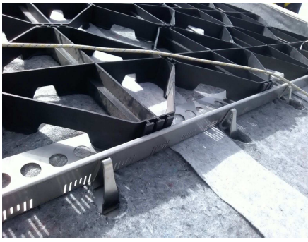
Detailed view of the shear barriers with TRP 80 eaves profile, Georaster and WSM 150 Mat.