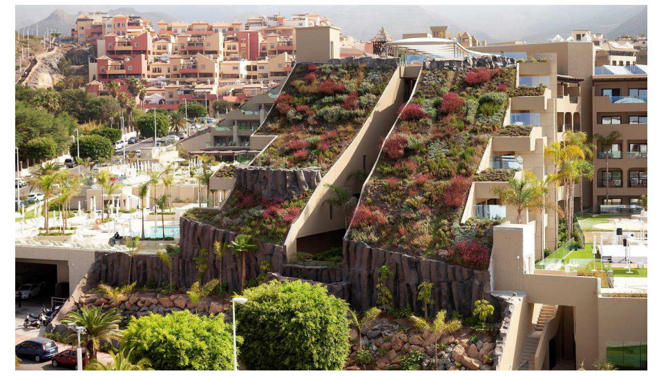
View upon the eyecatching steep pitched green roofs of 5-star GF Victoria hotel.