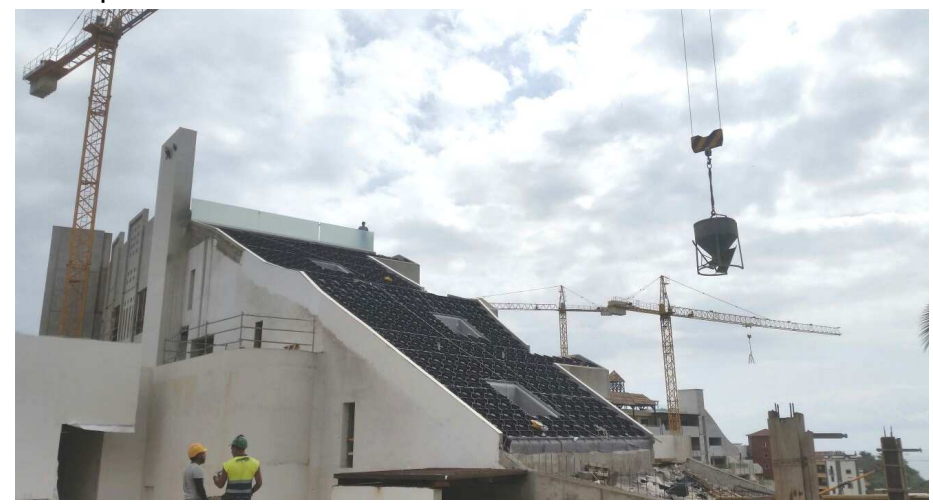
View upon one of the three steep pitched roofs after the installation of shear barriers and Georaster.