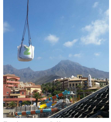
The substrate was applied by crane ... ...with a roof pitch of up to 45° a demanding installation job.

For irrigating the plants, which is a particular challenge with pitched roofs in dry climates, two coordinated irrigation systems were installed, which in combination with the ZinCo protection and water storage mat WSF 150 ensure an optimised water supply at the lowest possible consumption.