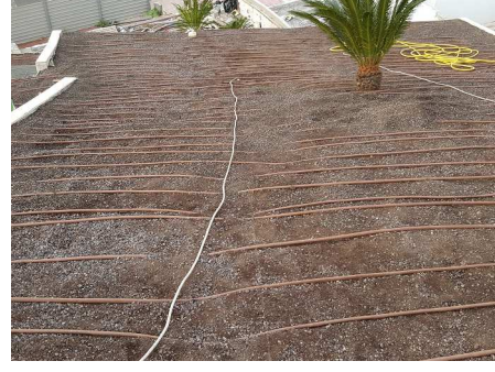
Two coordinated irrigation systems were installed for optimising the water supply.