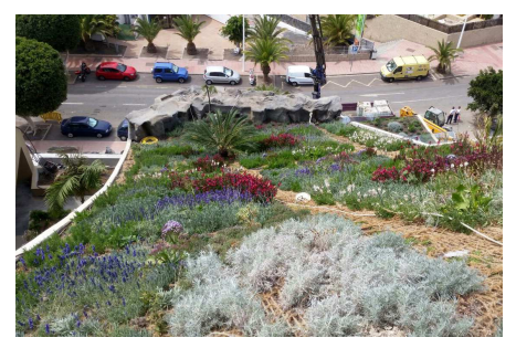
Before introducing the plants, the substrate was secured against erosion with a special organic glue and nets of coconut fibers. Instead of sedum mat planting customary for steep pitched roofs, shrubs and perennials adapted to the local climate were selected and developed well and quickly thanks to irrigation.