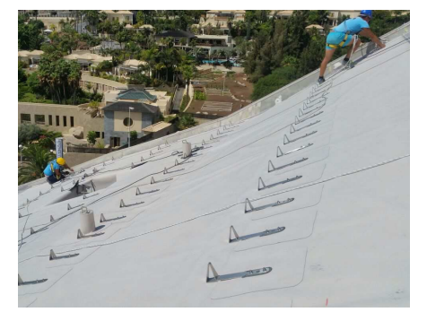
More than 700 Shearfix LF 300 support brackets had to be installed on the steep pitched roofs.