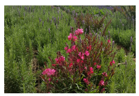
The planting scheme included plant species well adapted to the climate with low water requirements and resistant to strong solar radiation.